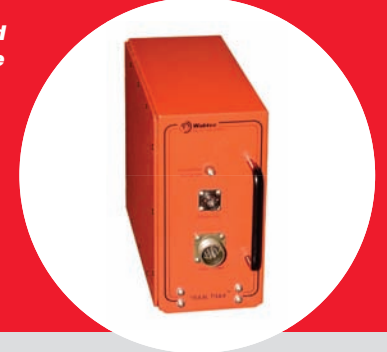
Crash Hardened Memory Module