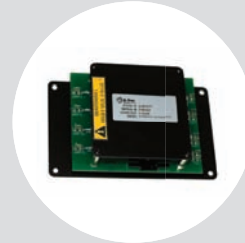
Differential Voltage Module (Current Based)