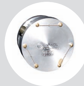
Axle Generator (Speed Based)