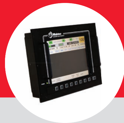
Computer Display Unit (CDU)