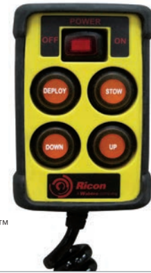
EXCLUSIVE DURA-TOUCH™ PENDANT

NOTE 3: Application dimension is inclusive bolt heads.